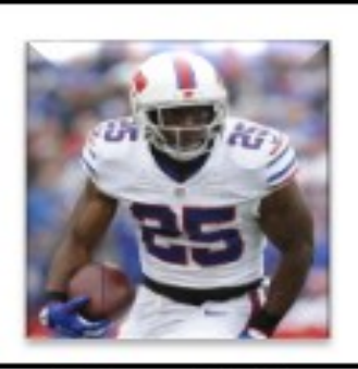
LeSean McCoy Buffalo Bills / Philadelphia Eagles / U. Pittsburgh