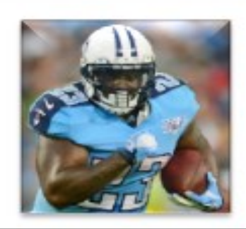
Shonn Greene NY Jets / Tennessee Titans / Iowa